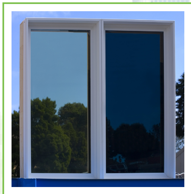
THE NEXT GENERATION Highly insulating with dynamic SageGlass® glazings.

of 0.35 - 0.5 BTU/h-ft 2 -F to levels of 0.1 - 0.15 BTU/h-ft 2 -F. At the same time, the strategy for optimal control of solar gain varies with season and climate in the U.S. Rather than argue over a high or low solar heat gain coefficient (SHGC), the year-round, all-climate solution is a variable SHGC that can be changed over a wide dynamic range. Supported by extensive simulation studies undertaken at the Lawrence Berkeley National Laboratory (LBNL) and in collaboration with industry, the Department of Energy (DOE) has set technical targets for the development of high performance windows. The long term goal for SHGC, for example, is for a range from 0.53 to 0.09.